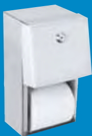
Surface Mounting Twin Roll Toilet Tissue Dispenser SSS