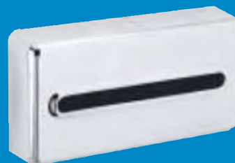
Facial Tissue Dispenser PSS