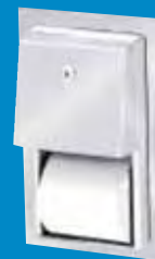
Recessed Mounting Twin Roll Toilet Tissue Dispenser SSS