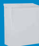
Sanitary Napkin & Towel Receptacle SSS