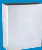
Towel & Waste Receptacle SSS