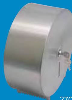
Toilet Tissue Dispenser SSS